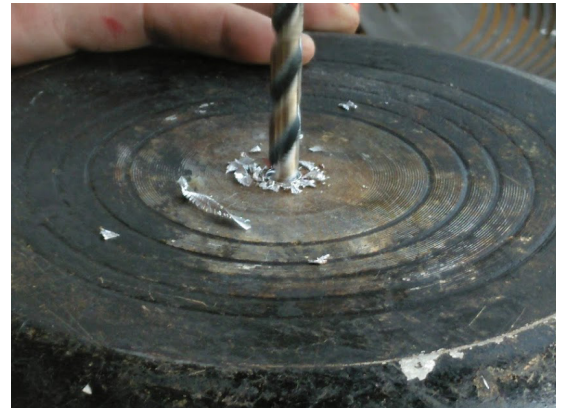
Figure 6. Preparing pans for horizontal or vertical mounting by drilling a hole in the center.