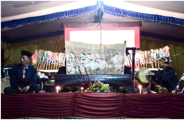
Figure 2. Traditional performance with Pacitan-style scrolls in Sragen, Central Java (2016).

an integrated part of the ritual ruwatan , a ceremony of purification of a village (Figure 2).