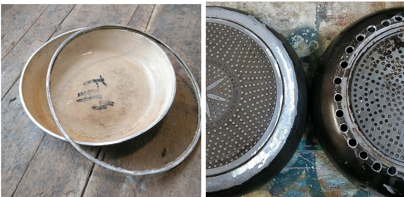
Figure 5. Raise the pitch by removing a slice from the rim. Lower the pitch by grinding on the curve where the side meets the bottom, or by drilling holes around the outside edge.

There is also the possibility of using pan lids. 4 These tend to work more like flat bells, closer to the ring mode described here, but with much less resonance than the pans.