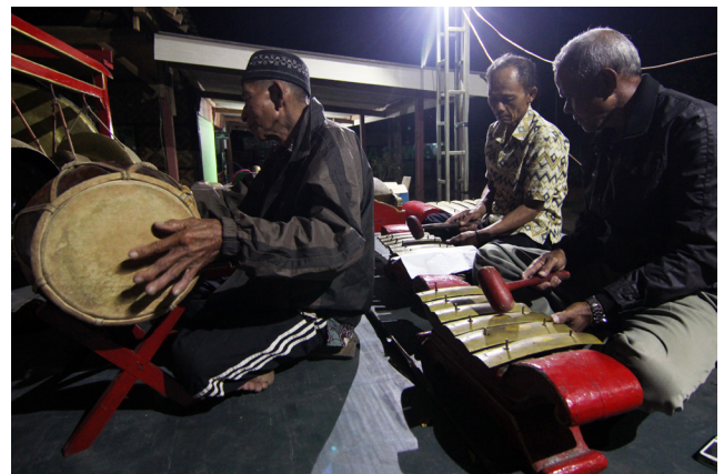
Figure 5. Rehearsal for a performance in Gelaran (2017).

People we talked to had different priorities for the preservation of wayang beber; either the scrolls themselves took precedence, or performances and the meaning they have in the local community was more important. Opinions also differed on who should be in charge of