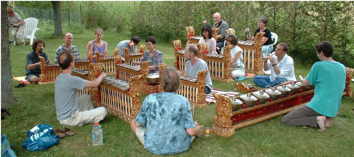
Figure 5. Gamelan Semara Winangun circa 2004–2005.

to tradition. In Montreal, the pedagogical dimension and the academic benefits of disseminating non-Western music prevailed. In Vancouver, it was the offer of an “alternative” musical practice for students that was valued. In contrast, Jon Siddall and ECCG were in search of a unique identity within Canada’s contemporary music scene. Far from being pigeonholed into one or another American model, Canadian gamelan ensembles sought early on to authenticate themselves through distinct trajectories and ideologies. Thus, the identity negotiations that began to take place within these ensembles in the 1990s obscured their position on the spectrum between ethnomusicology and composition.