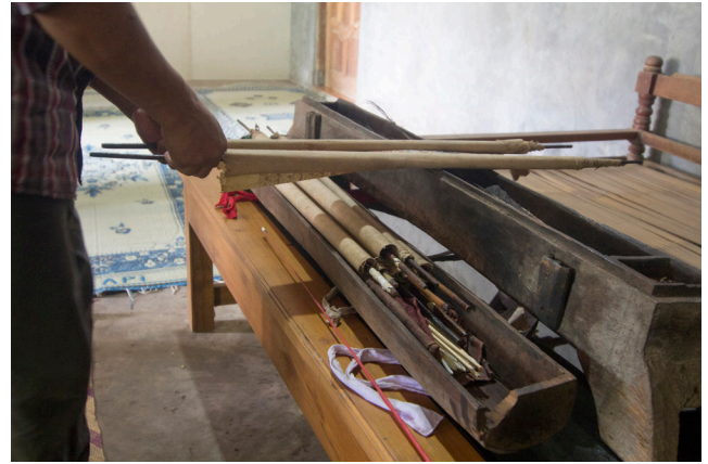
Figure 3. Storage of wayang beber Wonosari scrolls.