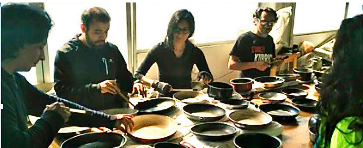
Figure 10. Community music group in Mexico City testing out their new instruments.

We have learned from our experiments that there are many possibilities for these endeavors. We are planning to expand opportunities for building and playing in Barcelona, including building a larger ensemble. As our activities develop, we will share them on the website for this project at pangamelan.org