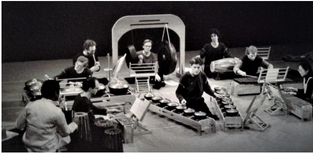
Figure 3. ECCG performing with Trichy Sankaran in December of 1984.