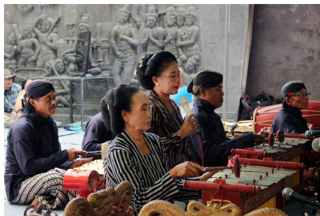
Figure 7. Musicians at a performance in Yogyakarta (2017).