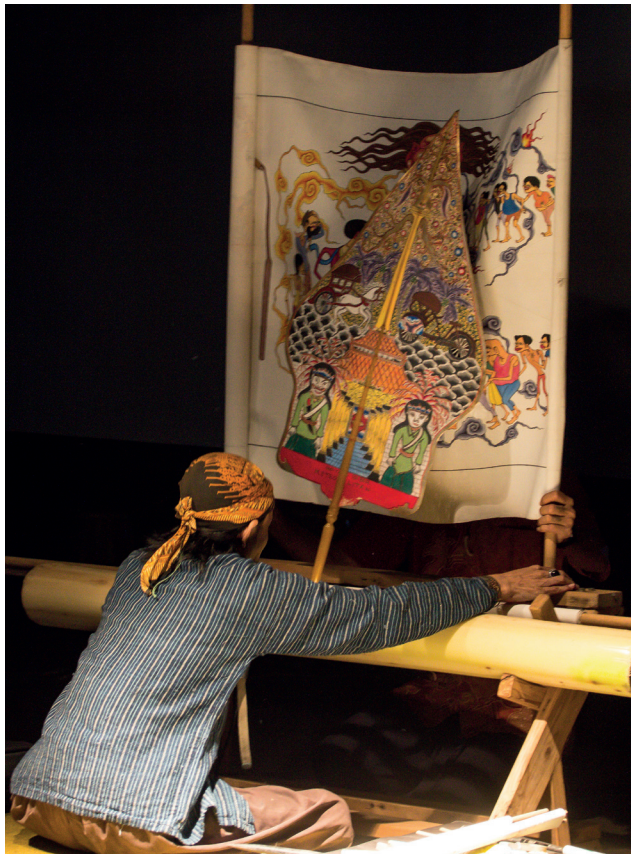
Figure 14. Including elements of wayang kulit in a performance, with a kayon held in front of the painted scroll.

The performance still follows the core principles of the traditional form and gives space for introducing new elements that are relevant to an urban community.