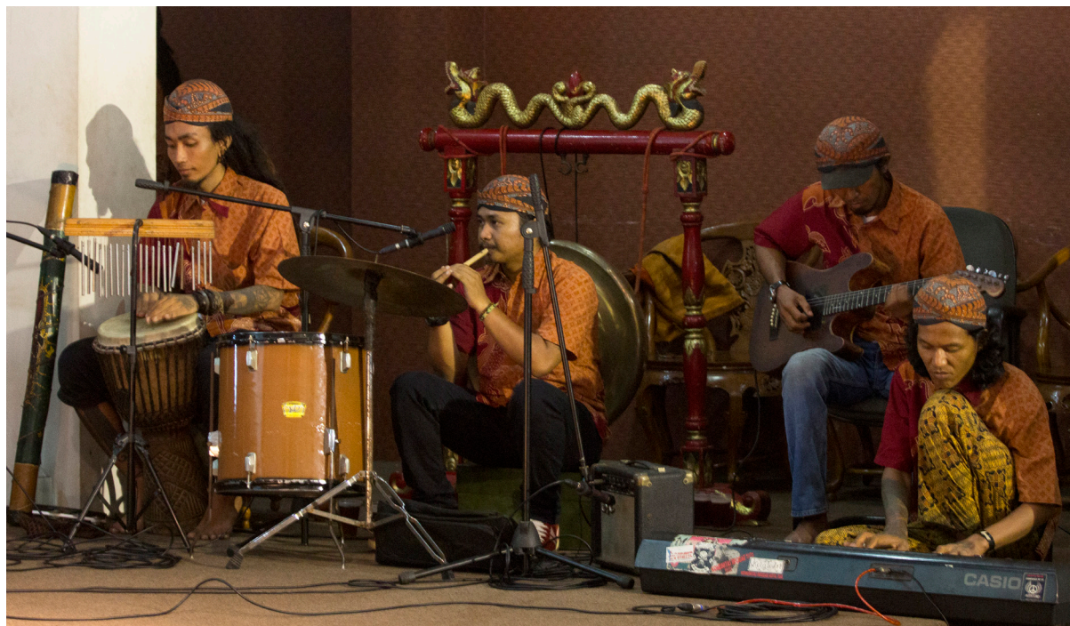
Figure 15. Musicians playing during a Wayang Metropolitan performance at the Wayang Museum, 18 September 2016.

For many young people, Wayang Beber Metropolitan's performances are their first encounter with wayang beber. Because of this, the group makes an effort to introduce the tradition and discuss it with the