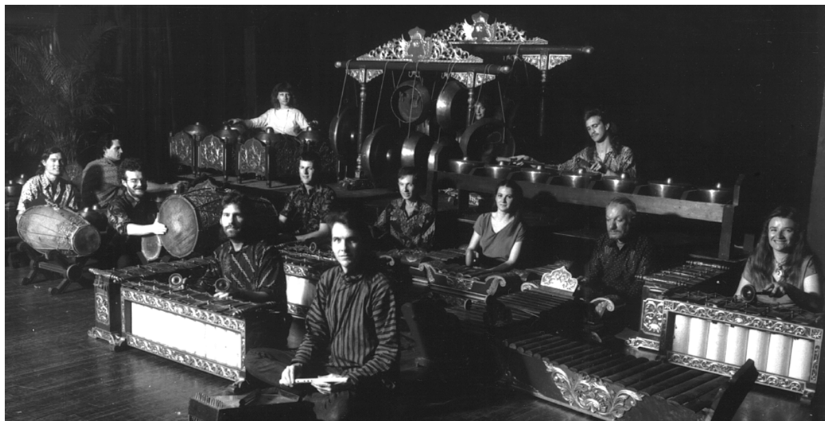
Figure 4. Vancouver Community Gamelan / Gamelan Madu Sari in rehearsal.