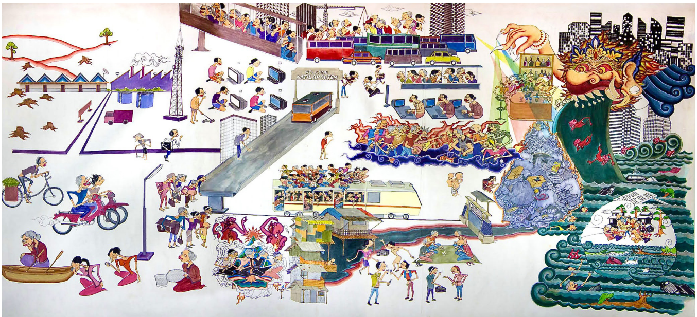
Figure 11. The scroll for “Kota Seribu Satu Mimpi”.

“The story presented in the performances no longer uses Panji as a narrative, but only the spirit of Panji which is inherent in the form of images and narration. Because the message about Panji is the loss of love, we try to revive it through an awareness of social criticism. The spirit of Panji can still be actualized and communicated in the present context through other media. It can be interpreted as lost love which we can present in the expression of wayang beber media.” (Wayang Beber Metropolitan 2012)