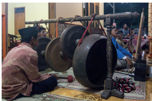
Figure 6. Wayang beber performance in Gedongpol (2016).

Another contemporary group is Wayang Beber Sakbendino , whose name can be translated from