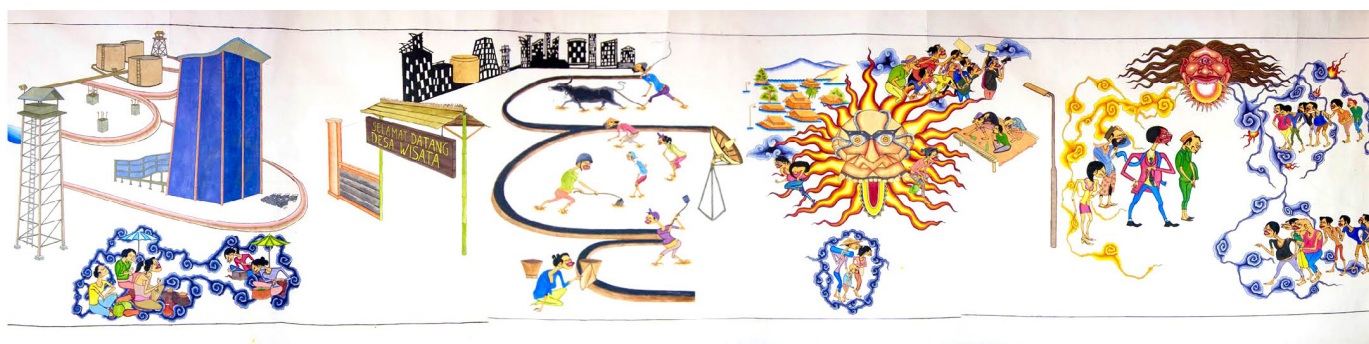
Figure 12. The scroll for "Teror di Teror."

No offerings were presented for this show as the original purpose and sacred values of traditional wayang beber performances are becoming less relevant and are even eliminated from most contemporary performances, so presenting offerings is also something that was excluded.