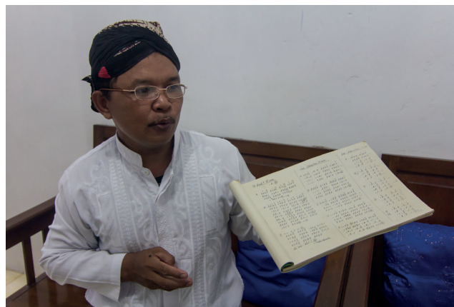
Figure 4. Wonosari dhalang showing gamelan notation (2016).

There are other changes as well. Some groups, like Wayang Beber Metropolitan and Wayang Beber Welingan, occasionally include female storytellers in