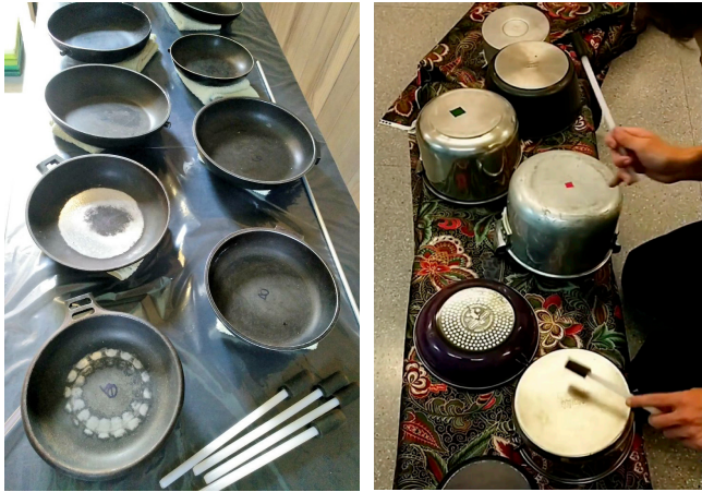
Figure 3. An array of PanGamelan instruments: ring mode (left) and membrane mode (right).

together, introducing damping techniques, interlocking parts, and gong structures. This approach can be applied to other instruments, of course, but in this post-industrial global-warming era, we feel the upcycling of used frying pans also has an ecological value. We have to consider how much we spend and what we spend it on, as well as make durable sound objects that escape the programmed obsolescence of a materialistic society.