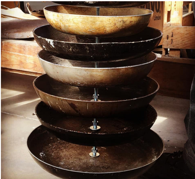
Figure 7. Vertically-mounted pans on a threaded rod, separated by nuts and washers. (In a finished instrument, the nuts will be tightened all the way down.)