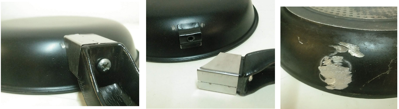
Figure 4. Steps to remove pan handles: 1) Identify how the handle is attached. 2) Unscrew or cut the handle off. 3) Grind off brackets if needed.

to keep them in position without rattles or vibration interference (Figure 7).