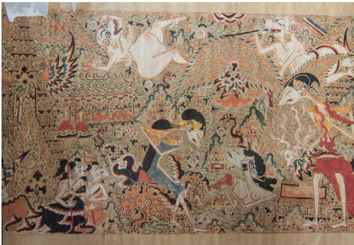
Figure 1. Scene from the Wonosari scrolls (2016).