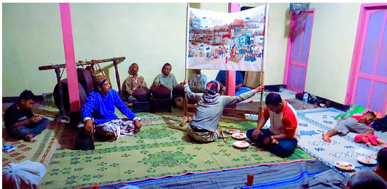
Figure 10. Wayang Beber Sakbendino performing in the Pacitan region with a scroll painted by Dani Iswardana (2016).

The group explains on their blog how something connected to old Javanese stories becomes relevant in presenting a moral story for today's audiences.