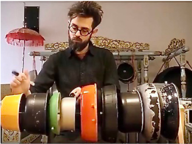
Figure 11. The author playing a PanGamelan instrument in the gamelan room in Graz, Austria.

The PanGamelan basics presented here can be expanded in many ways. We have used materials with different acoustic properties to make other kinds of instruments: aluminum for portable gangsa (called Gamelinus), PVC pipes for suling, wood to make keys for xylophones, like gambang. There are possibilities using auto-resonant pieces: PVC pipe for bass percussion, bamboo tubes for rindik and/or jegog, stringed instruments and so on.