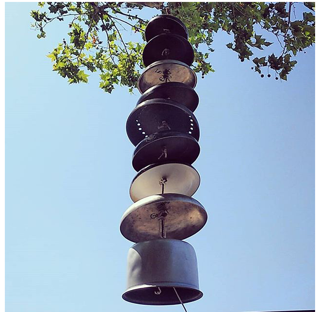
Figure 9. Vertically-mounted pans separated by knots.

All of our information is shared on the principles of Creative Commons. It is not just about the sound, or making gamelan-type instruments, it is about being generous, giving away what we love and acknowledging every cultural and technical source we learn from. We believe our contemporary world needs spaces for people to meet and discover the joy