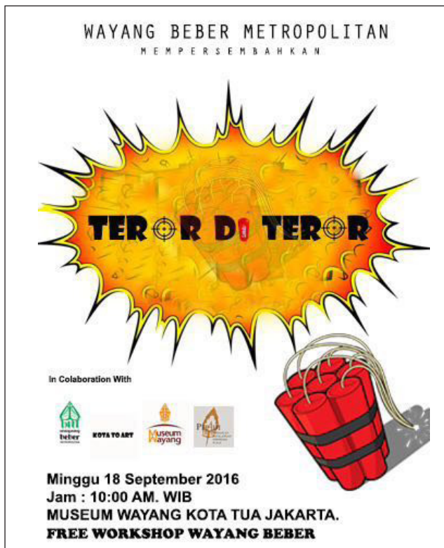
Figure 13. Poster for “Teror di Teror.”