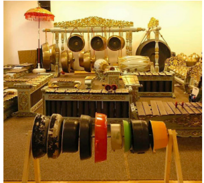
Figure 1. A PanGamelan instrument made for the Javanese gamelan at the University of Performing Arts in Graz, Austria.

These experiments and experiences inspired us to develop new instrumental, compositional, and performance ideas.