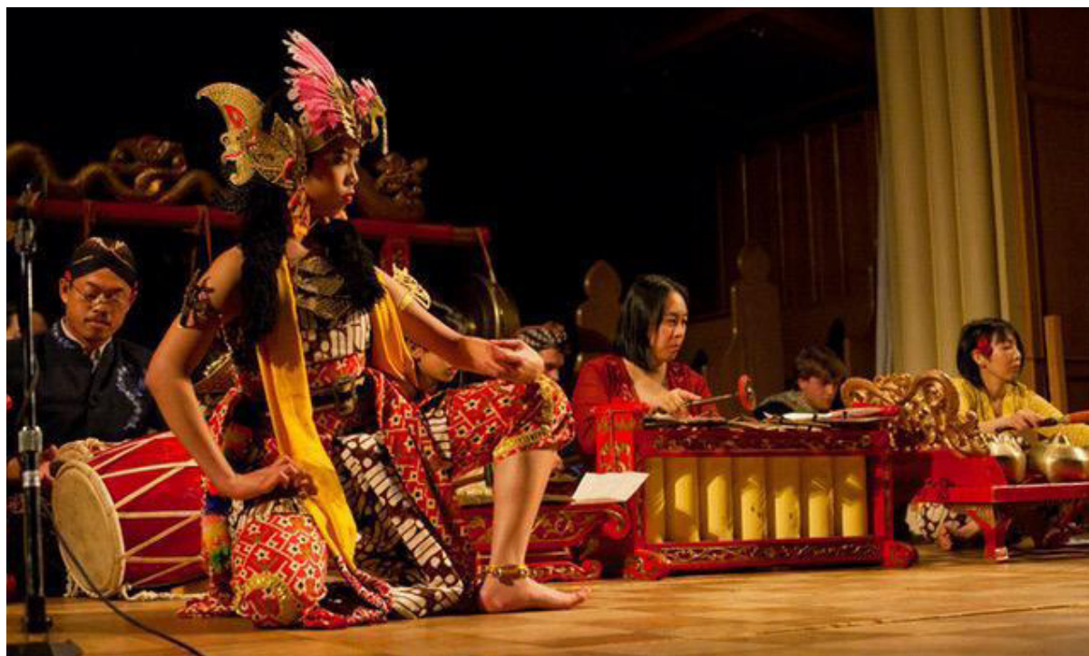
Figure 2. Busy Island Gamelan at the "Inspired by Java" earthquake relief concert in 2012.