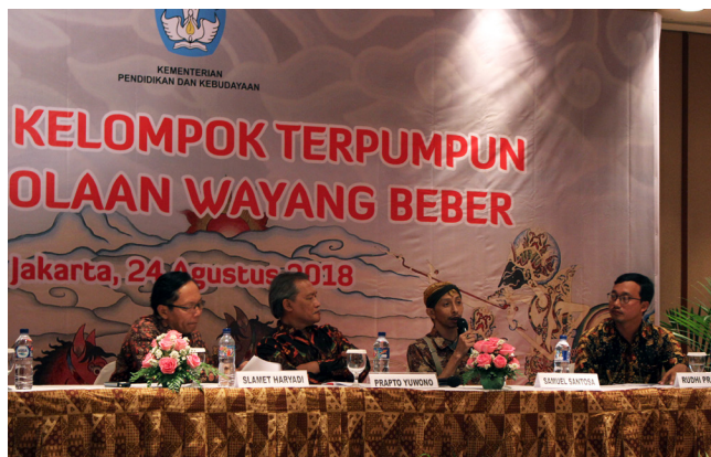
Figure 20. The event at the National Museum in Jakarta that included a discussion on preserving wayang beber.

Surakarta (ISI), which gave her insight into Indonesian art and culture and opened the door to the topic of wayang beber. She describes an encounter in 2013 with Wayang Beber Welingan, “[This group] inspired my curiosity to peek deeper into wayang beber, to look at its history, and to wander around Java in a search for stories, people, and meanings. From this our Wayang Beber Project was born.”